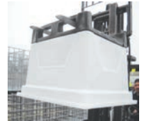
Fork-lift / rotatable